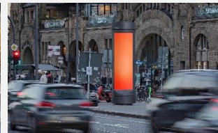
PV CITY TOWER